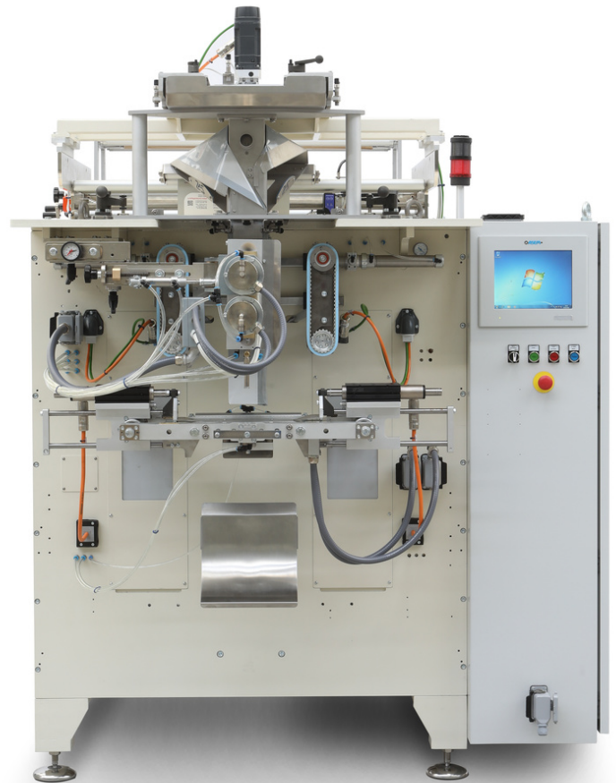
Vertical packaging machine mod. VS150

VS150 can be equipped with the SB20 forming unit with modular structure and independent stations for the production of double square bottom bags with welded and folded top and resealable with label (Granoro currently has four) or with top carton applicator AC50, an independent applicator for top carton display on block bottom bags made by Ricciarelli too.