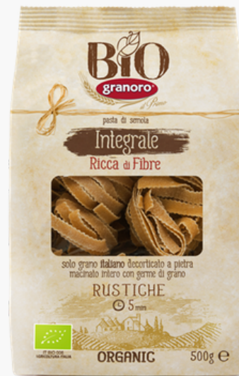
500g square bottom bags of Rustiche n°251