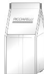
Top carton display bag