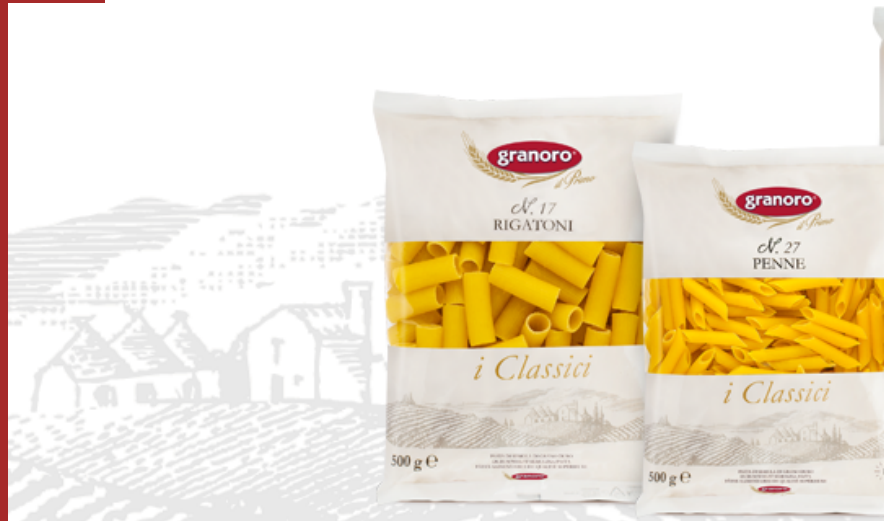
500g pillow bags of short goods pasta

the graphic but to the shape and quality of the package itself too. Making a quality package, without defects and perfectly closed, is absolutely necessary and it is also synonymous with goodness and safety of the product so it means a great help on a commercial level».