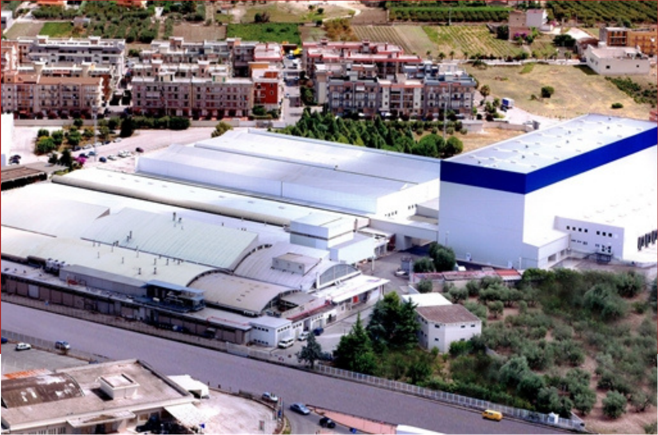
Granoro pasta factory plant in Corato (Bari, Italy)